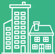
# Real Estate

As a directed custodian, Strata Trust Company (“STRATA”) provides the unique ability to custody self-directed IRAs that hold a wide