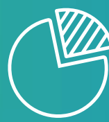
# Private Equity