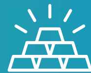
# Precious Metals

STRATA Trust Company (“STRATA”) performs the duties of a directed (passive) custodian, and as such does not provide due diligence to third parties regarding prospective investments, platforms, sponsors, dealers or service providers. As a custodian, STRATA does not sponsor, endorse or sell any investment and is not affiliated with any investment sponsor, issuer or dealer. STRATA does not provide investment, legal or tax advice. Individuals should consult with their investment, legal or tax professionals for such services.